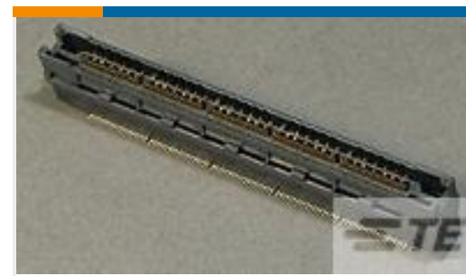
TE Part # 767178-5 MICTOR RAISED VERT RECPT ASSY,