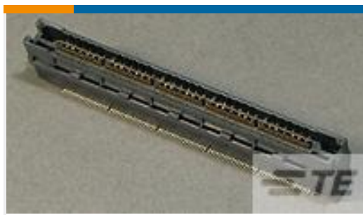
TE Part # 767130-5 MICT,RCPT,190,ASY,GOLD,EXTD