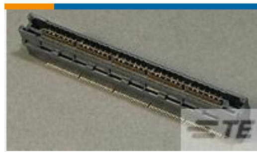
TE Part # 767154-5 190 POS. .355 VERTICAL RECEPTE