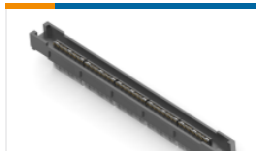
TE Part # 767143-5 MICT,R/A,RCPT,190,ASY,062,30AU